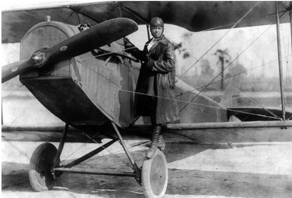
Bessie Coleman standing on the wheel of a plane.

Look at the image. You will see a plane. This plane was made a long time ago. You will also see a pilot. A pilot is a person that flies a plane. The pilot in this image was a woman named Bessie Coleman.